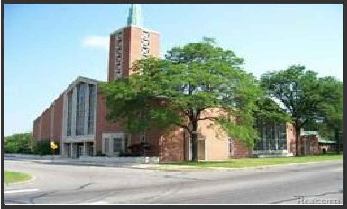
Cathedral of St. Augustine's